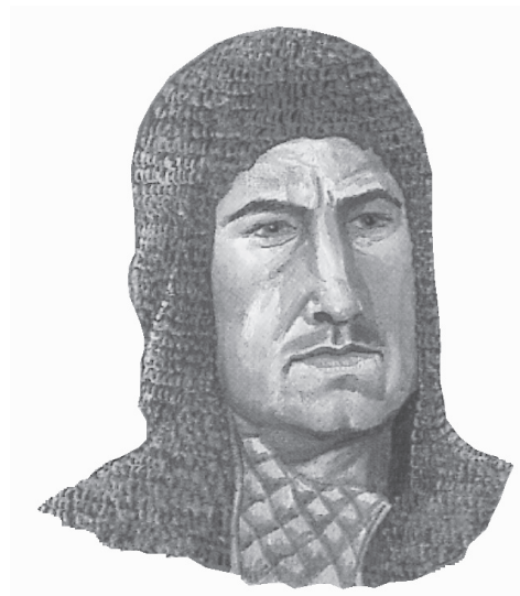
William of Normandy